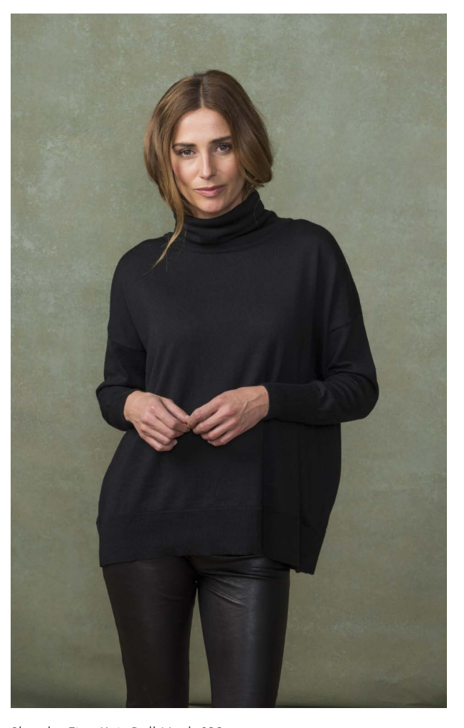
Slouchy Fine Knit Roll Neck £88 Stretch Leather Leggings £445