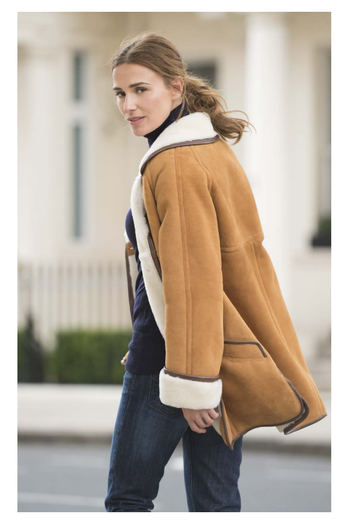
Leather Trim Sheepskin Jacket £695 Merino Roll Neck £78