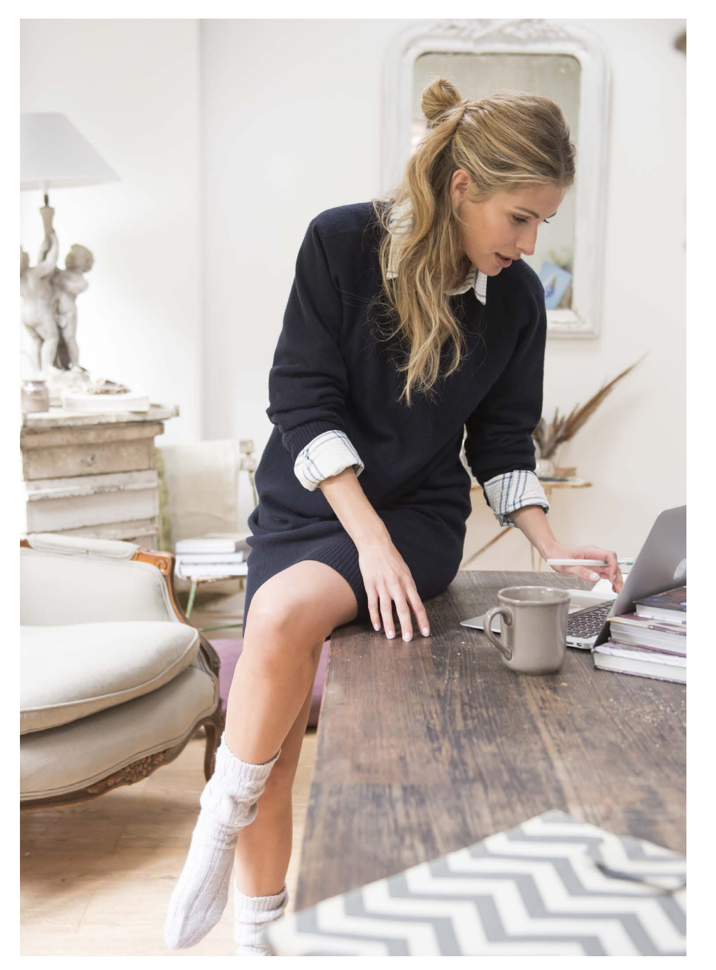
Supersoft Slouch Dress £98, Brushed Cotton Shirt £70, Cashmere Sleep Socks £69