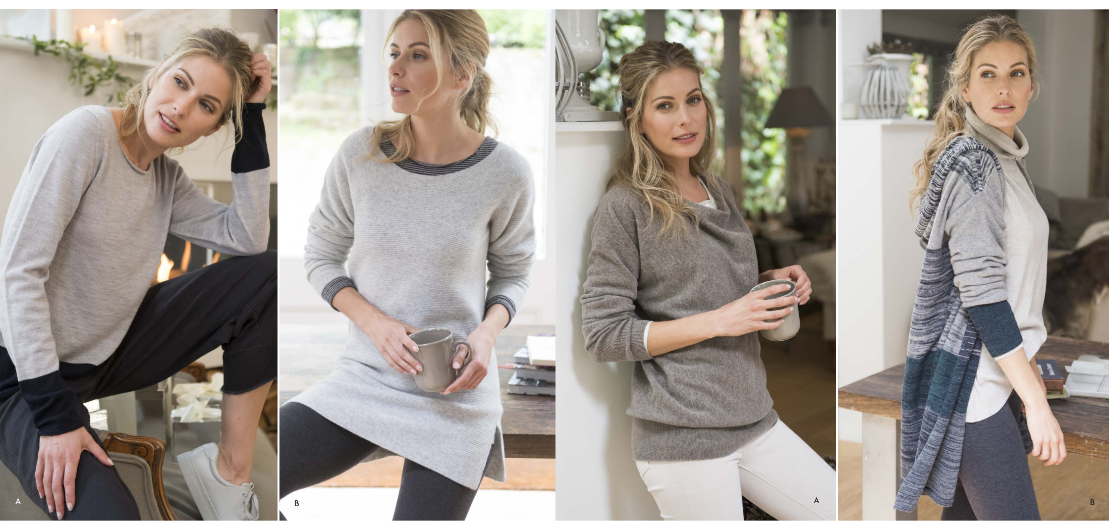
A. Fine Knit Merino Crew-neck £70B. Yoke Detail Tunic £92, worn with Fine Knit Merino Crew-neck £70, Merino Lounge Pants £72